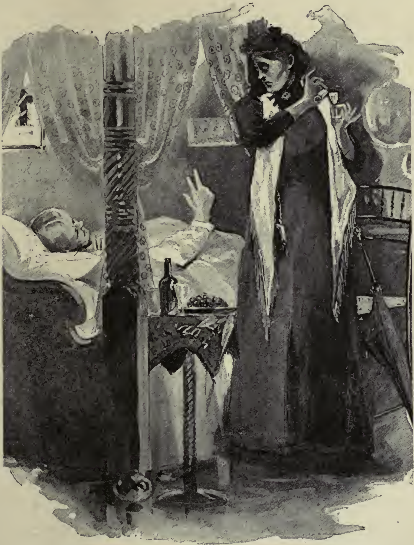
MR. GRULE TOOK THE MEASLES.

suitable matrimony induced by the unnecessary attendance of Miss Bray. Finally, I